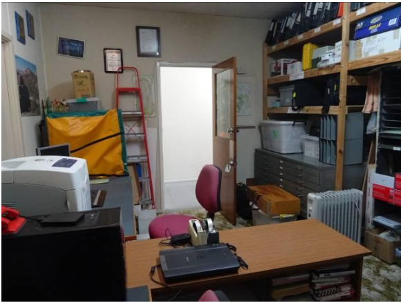
The "old" office from the chair.