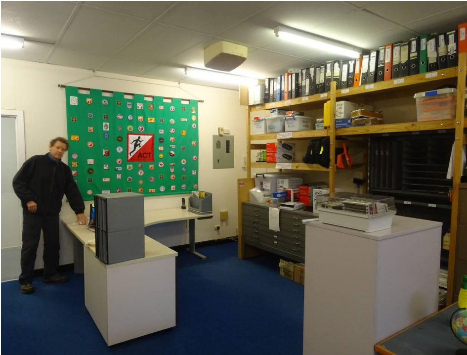
The "new" office after the move (except computer and printer)