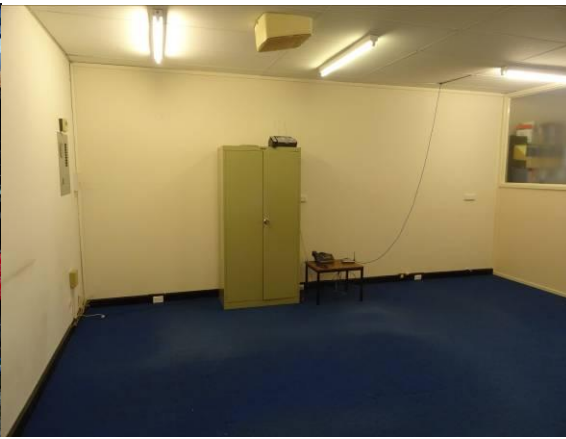
The "new" office before the move.