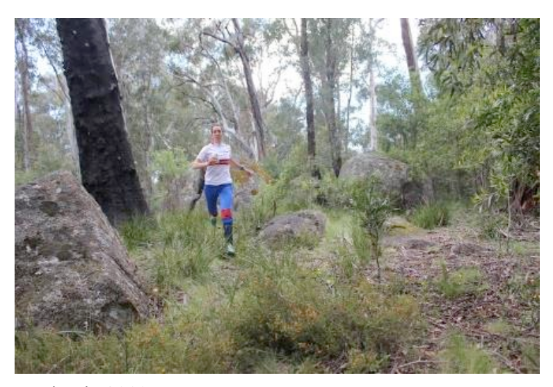
Left - Still Orienteering in 2011

It was a long way back with a lot of back pain and hard work. One of her major goals was to be selected again in the WOC team. Her selection in the Australian team 2003 Switzerland was one the highlights of her life and resulted in a lot of pent-up emotion. She missed the Final by one place. It was the only time she had missed out on making the final in JWOC and WOC events.