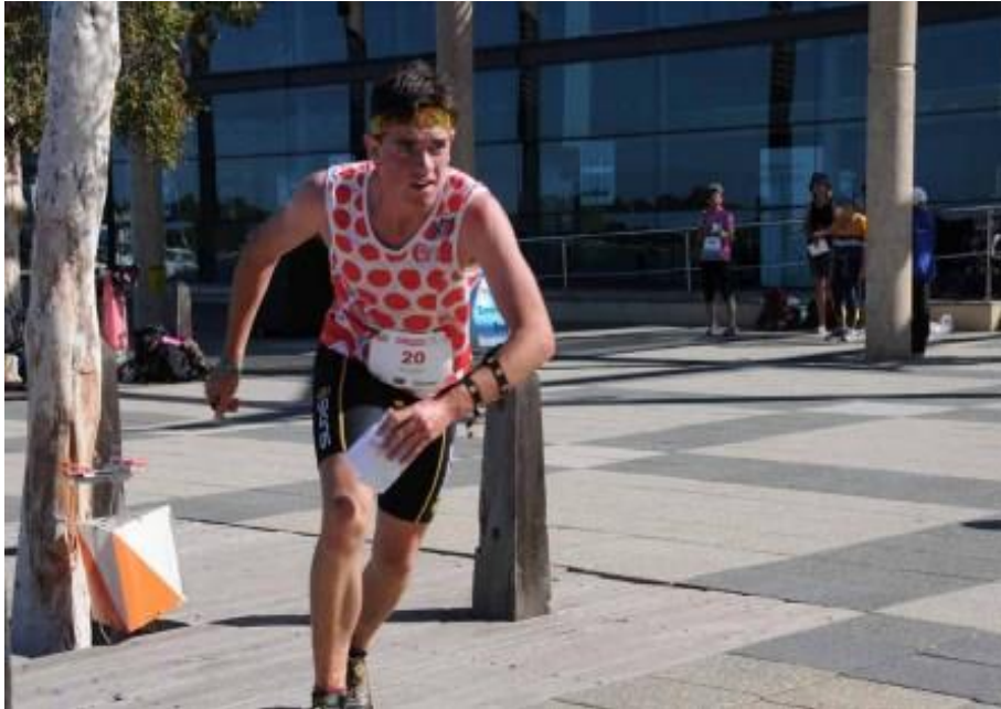
Mandurah Marina WA 2011